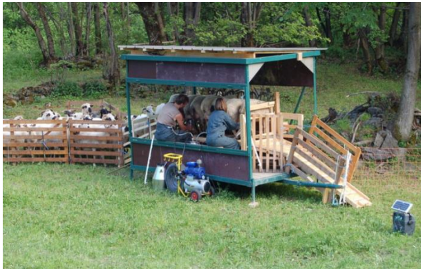
Farm du Fardelier