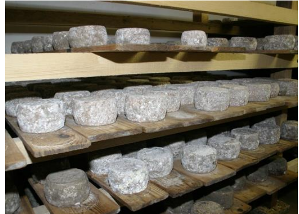
Farm St. Pierre