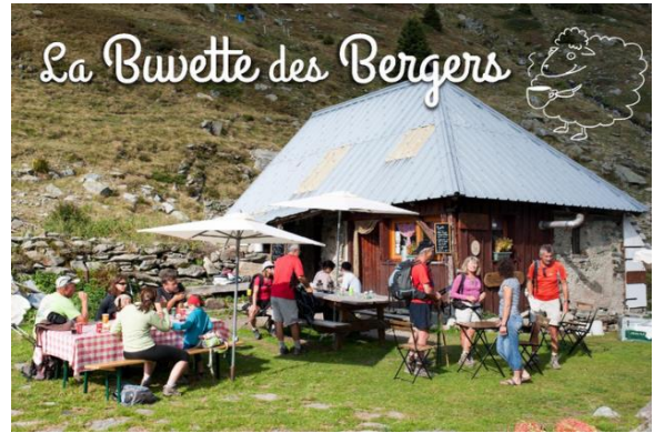
Example for a Shepherds restaurant