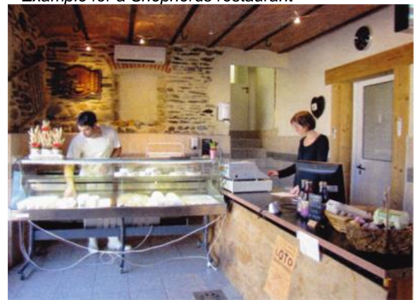
Shop of cheese producers