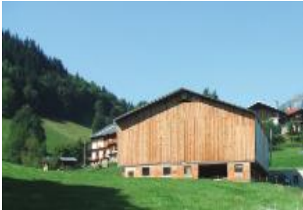
GAEC de la Fontaine